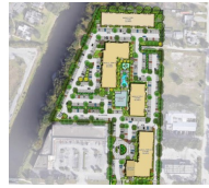
$35,351,000 Whole Loan: Construction 230-Unit Lake Worth, FL