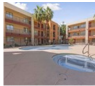
$52,000,000 Whole Loan 401-Unit Las Vegas, NV