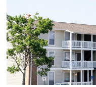
$21,000,000 Whole Loan 289-Unit Birmingham, AL