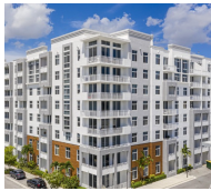
$65,800,000 Preferred Equity 631-Unit Doral, FL