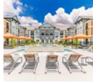
$26,600,000 Whole Loan 227-unit Houston, TX