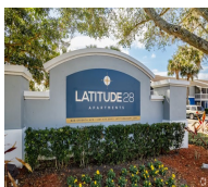
$8,565,000 Preferred Equity 354-Unit Altamonte Springs, FL