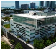
$41,000,000 Whole Loan Miami, FL