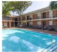
$60,000,000 Whole Loan 1,326-unit Houston, TX