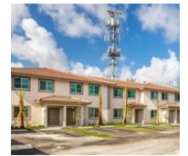
$46,600,000 Whole Loan 137-unit Miami, FL