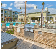
$13,900,000 Preferred Equity 281-Unit New Braunfels, TX