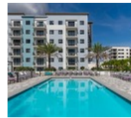
$52,000,000 Whole Loan 230-unit Beaverton, OR