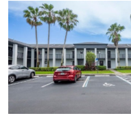
$10,683,000 Preferred Equity 225-Unit Davie/Coral Springs, FL