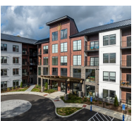
$8,500,000 Preferred Equity 111-Unit Bloomfield, CT