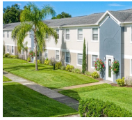
$16,400,000 Preferred Equity 320-Unit Altamonte Springs, FL