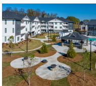
$9,000,000 Preferred Equity 420-Unit Pendergrass, GA