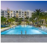
$84,000,000 Whole Loan 227-unit Miami, FL