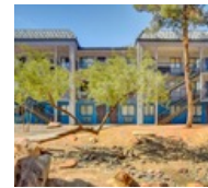
$48,000,000 Whole Loan 455-Unit Las Vegas, NV