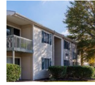
$13,684,000 Preferred Equity 287-Unit Virginia Beach, VA