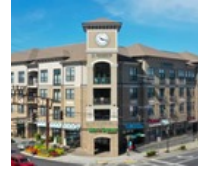
$10,000,000 Preferred Equity 283-Unit Atlanta, GA