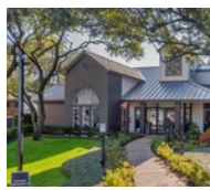
$7,593,000 Preferred Equity 341-Unit Dallas, TX