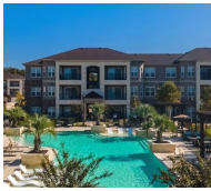
$36,000,000 Whole Loan 304-Unit Houston, TX