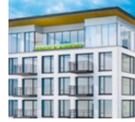
$25,000,000 Whole Loan: Construction 149-Unit Salt Lake City, UT