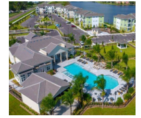
$20,120,000 Preferred Equity 288-Unit Daytona, FL