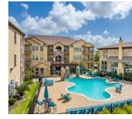
$10,918,000 Preferred Equity 532-Unit Corpus Christi, TX